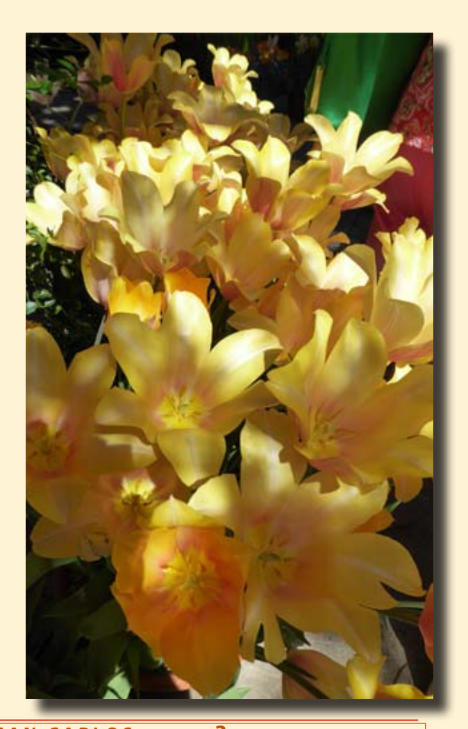
MAY 2016 CIVIC GARDEN CLUB OF SAN CARLOS page 3