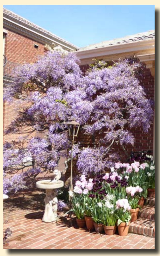
MAY 2016 CIVIC GARDEN CLUB OF SAN CARLOS page 4