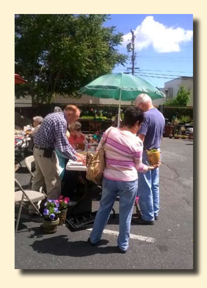
ANNUAL PLANT SALE APRIL 23, 2016